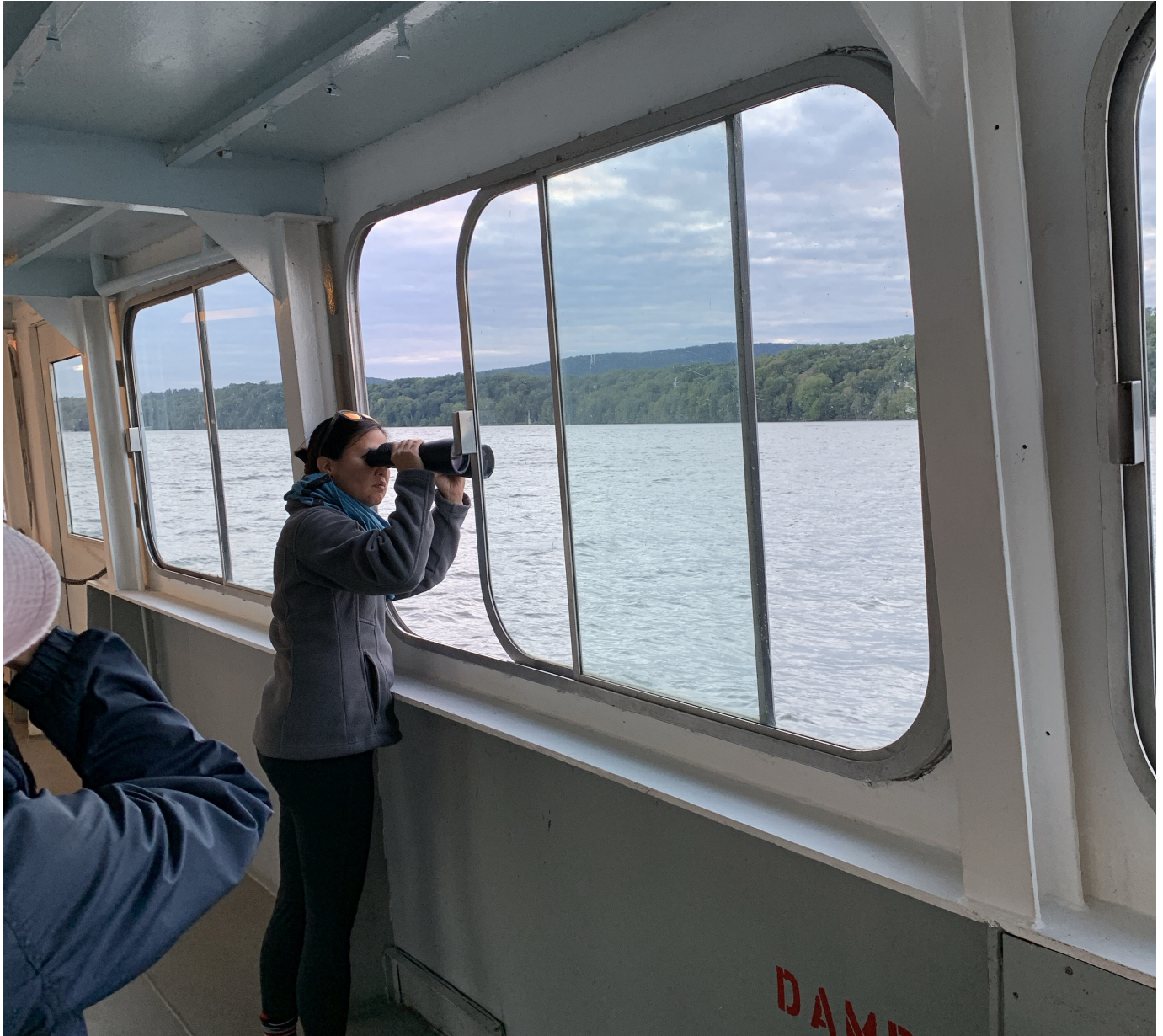
TAKING FLIGHT: BIRDING IN THE CATSKILLS / NYSOA 2019