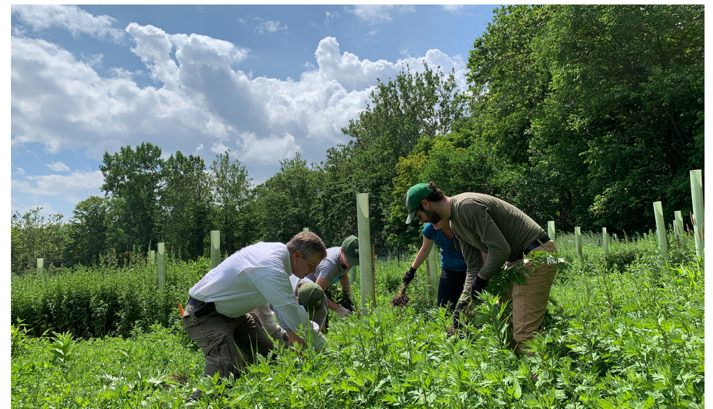
TREES (COURTESY OF TRIBES) BEING PLANTED AT THE THORN PRESERVE