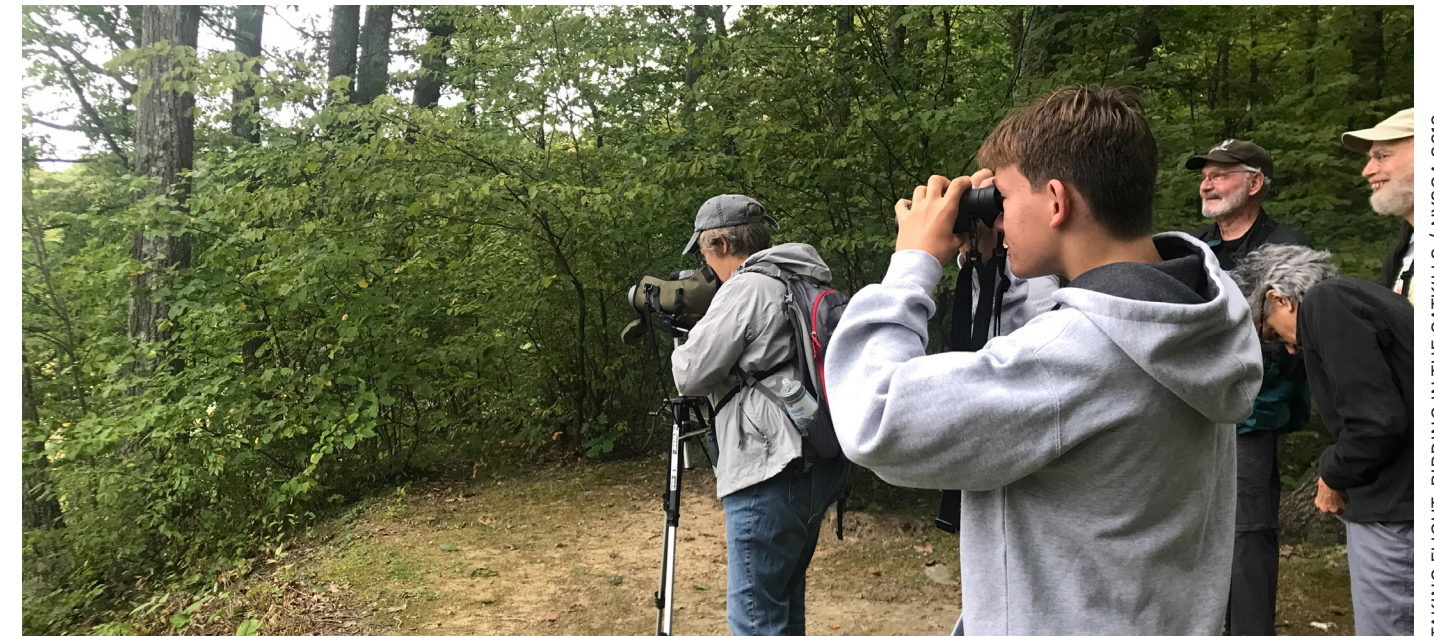
TAKING FLIGHT: BIRDING IN THE CATSKILLS / NYSOA 2019

Our continuing efforts, including our advocacy work in Albany to bring more resources to the Catskill Park, saw success in 2019. In addition to Catskill Park Day, the Catskill Center participated in other advocacy days for conservation and Catskills issues including Environmental Protection Fund Lobby Day, Tick and Lyme Day, and Catskill/Adirondack Forest Preserve Lobby Day. In 2019, thanks to the efforts of the Catskill Park Coalition (which the Catskill Center co-chairs), we saw more than $10 million in investment from New York State in the Catskill Park, including new access points, improved parking, upgrades and repairs at State Campgrounds, and much more.