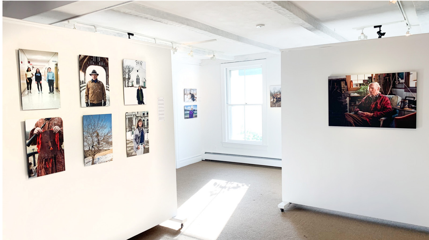
NATURAL RESOURCES: 50 STEWARDS OF THE CATSKILLS AT THE ERPF GALLERY