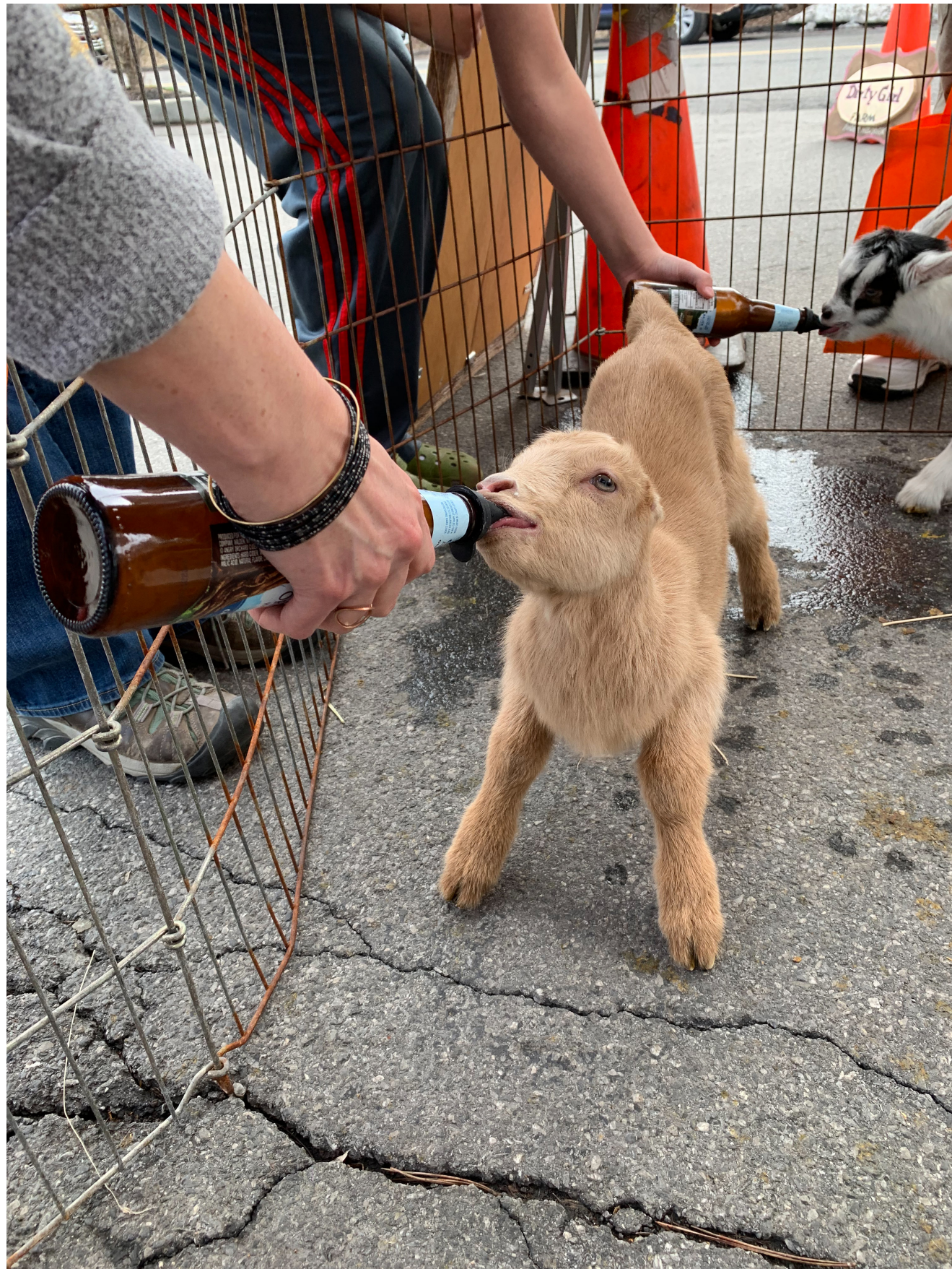
DIRTY GIRL FARM AT THE CATSKILLS GREAT OUTDOOR EXPO 2019

The Friends of Platte Clove helped complete projects at Platte Clove, such as the installation of new cooking and heat stoves. The improvement of the stone steps to the Artists' Cabin is currently in the planning stage. 2019 saw the inaugural group of Invitational Artists of the Friends of Platte Clove. Selected by the Friends, four diverse artists were invited to reside at the Cabin.