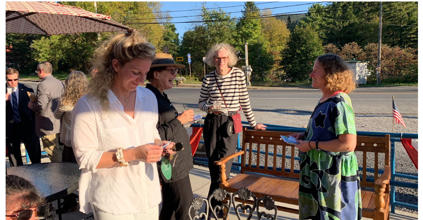
REVELERS AT THE 2019 FALL GALA