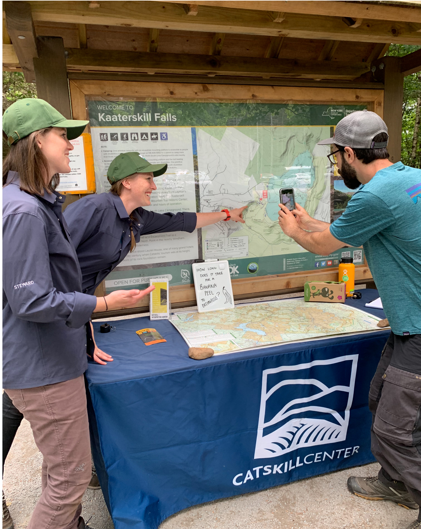
CATSKILL STEWARDS AT KAATERSKILL FALLS